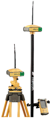
Base and Rover RTK

If you're looking for an economical RTK solution that provides advanced technology, wireless system design, and rugged, waterproof construction look no further. Topcon's Green Label HiPer Ga and HiPer Gb are the cost-effective answer you've been waiting for!