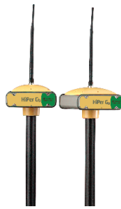
Dual Rover RTK

The HiPer Ga can be configured as a cable-free base and rover system for traditional applications, or as two rover receivers from a fixed base station or a GNSS network system, via radio or cellular communication.